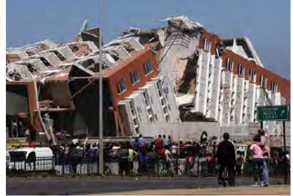
The 2010 Chilean earthquake occurred off the coast of the Maule Region of Chile on February 27, 2010. None of ESCO's arresting systems in Chile were damaged as a result of the massive quake.