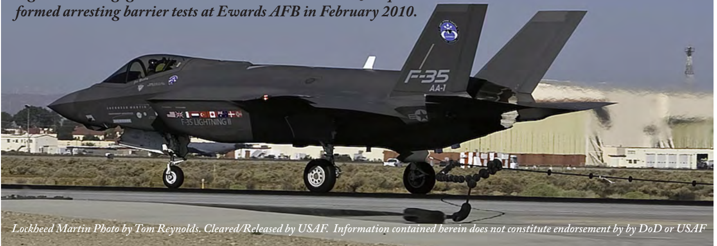
Cleared/Released by USAF. Information contained herein does not constitute endorsement by DoD or USAF

The F-35 Joint Strike Fighter comes to a slow, smooth rest following a barrier engagement with the ESCO BAK-12. The JSF performed arresting barrier tests at Edwards AFB in February 2010.